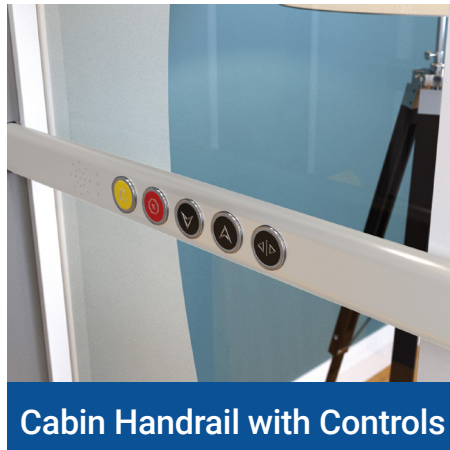
Cabin Handrail with Controls