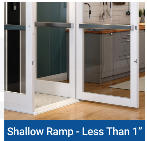
Shallow Ramp - Less Than 1"