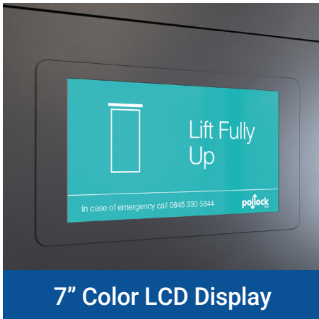
7" Color LCD Display