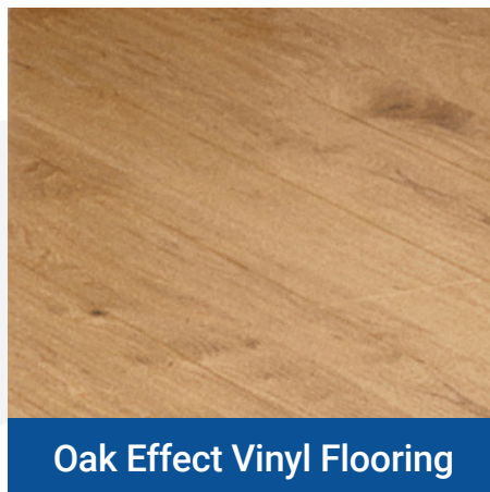
Oak Effect Vinyl Flooring